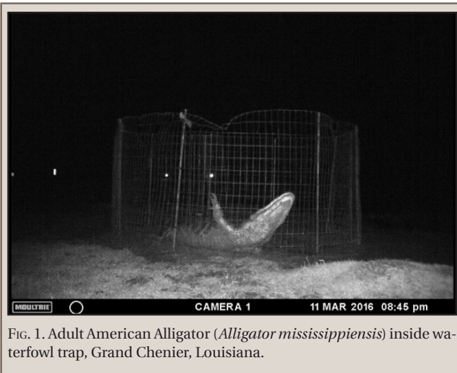
FIG. 1. Adult American Alligator ( Alligator mississippiensis ) inside waterfowl trap, Grand Chenier, Louisiana.

One of us (RME) has previously captured a juvenile alligator (ca. 122 cm total length) in a walk-in turtle trap placed in a local freshwater pond; and co-workers have caught adult alligators in Fyke nets (Selman et al. 2014. Chelon. Conserv. Biol. 13:131–139) used to trap Malaclemys terrapin (Diamondback Terrapins) in brackish-saline habitats. In a multi-year study in southwestern Louisiana, nine alligators (ca. 91–244 cm total length) were caught in 504 trap days; in one instance two alligators were caught in the same Fyke net on the same day (W. Selman, pers. comm.). The nets were initially unbaited,