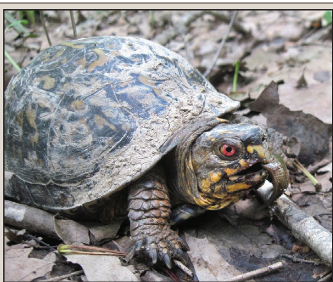
FIG. 1. Terrapene carolina consuming a leech, Johnson County, Illinois.