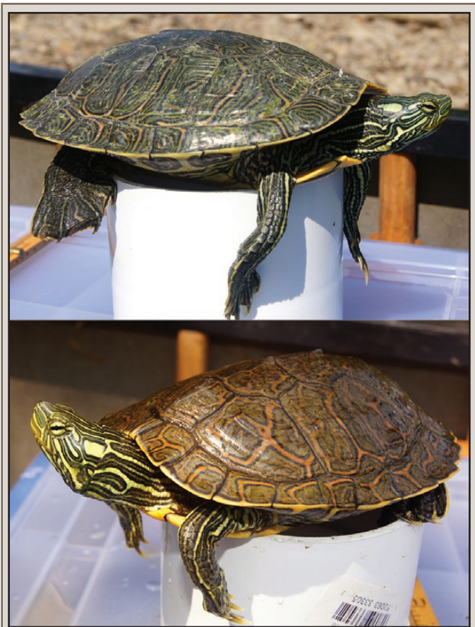
FIG. 2. Lateral views of two male hybrids between Graptemys geographica and Trachemys scripta elegans (North Fork Saline River, Gallatin County, Illinois) captured August 2014. Note the large postorbital blotches and carapace patterning.

were present on the female and one male but nearly absent on the other male. Both males possessed large yellow postorbital blotches while the female possessed a prominent pale-yellow postorbital stripe. The female (midline carapace length [MLCL] = 18.6 cm; width = 14.8 cm; mass = 624 g) was larger than the males (MLCL = 14.3 cm; width = 11.1 cm; mass = 283 g; and MLCL = 11.9 cm; width = 10.0; mass = 227 g respectively) but did not display megacephaly; the head was not noticeably wider than similarly sized male T. s. elegans captured at the location.